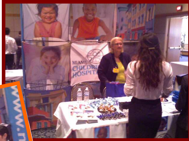
FIU Medical Students learn about the MCH Pediatric Residency Training Program

The MCH department of Medical Education and the MCH Pediatric Residency Program participated in the first FIU College of Medicine Residency Fair on January 21st, 2011. First and second year medical students from FIU and FIU faculty visited the booths and obtained information about residency training.