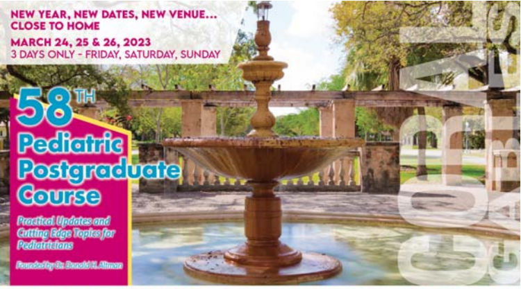
March 24 - 26, 2023 | NEW LOCATION! Practical Updates and Cutting Edge Topics for Pediatricians

ers, topics, and be able to register for the course.