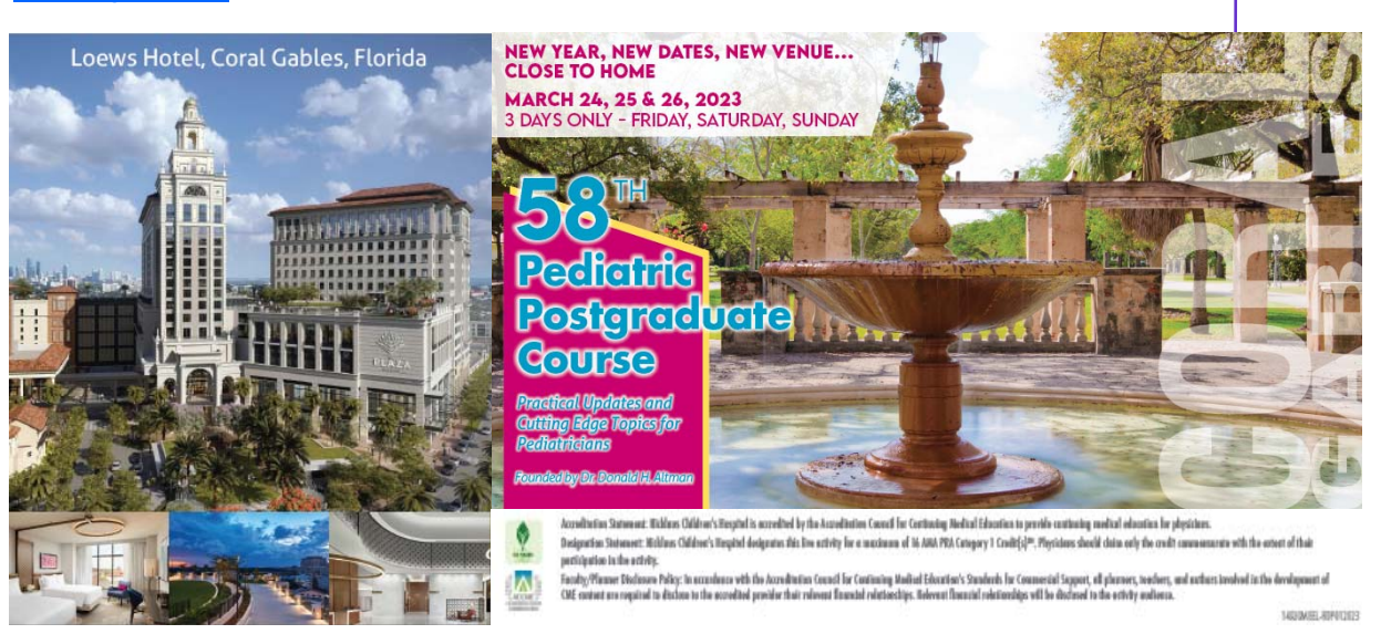
March 24 - 26, 2023 | NEW LOCATION!

Join us for the live course, network with colleagues, visit with the exhibitors, and learn from our national experts, host faculty and guest faculty. See you in March 2023 at the 58th Annual PPGC. The course is designed for practical tips and hot topics in pediatric care.