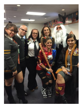
The Medical Education Team