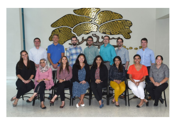
New Incoming Fellows