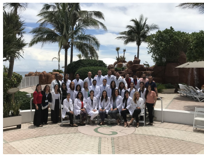
THE CELEBRATION ISSUE!!!