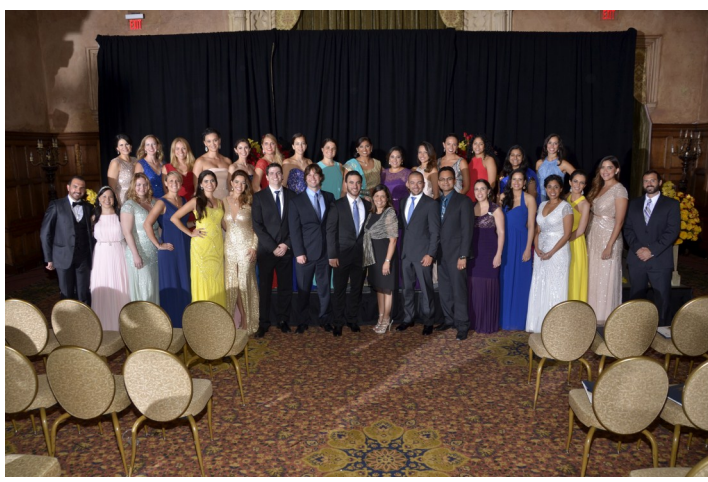
The Residency Class of 2015