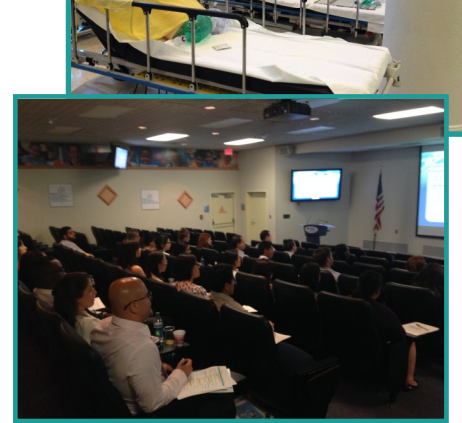
New Residents' Orientation